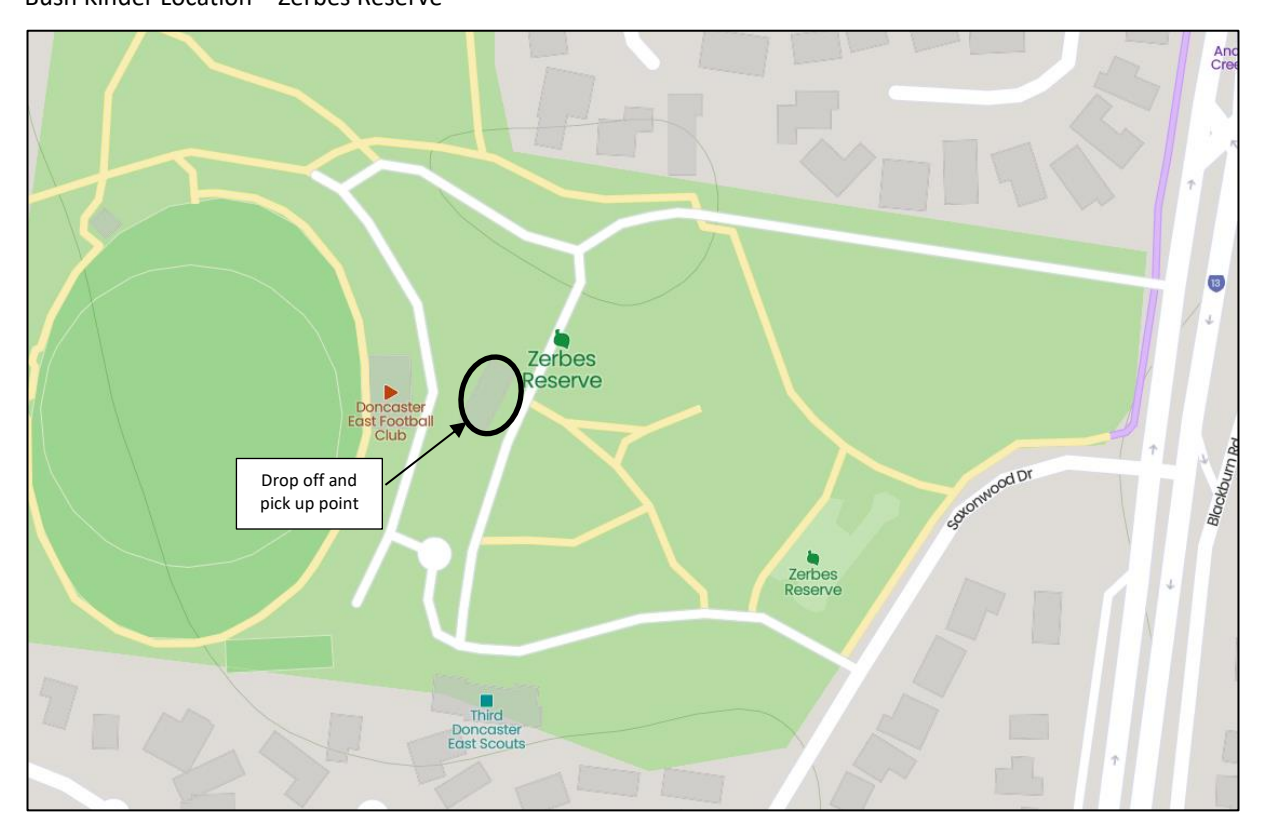
Meeting Point – drop off and pick up